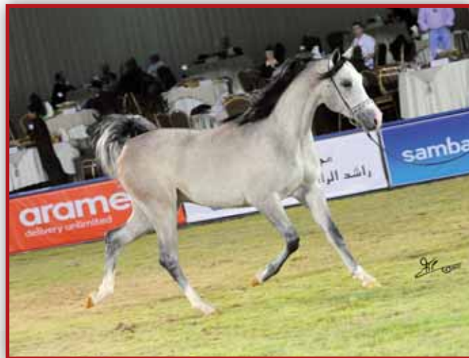
EZZ DIRAB (Rezaiq x Barqat Dirab) Owner: King Abdul Aziz Arabian Horses Center at Dirab 1 pl. Colts Desert Bred Best Movement