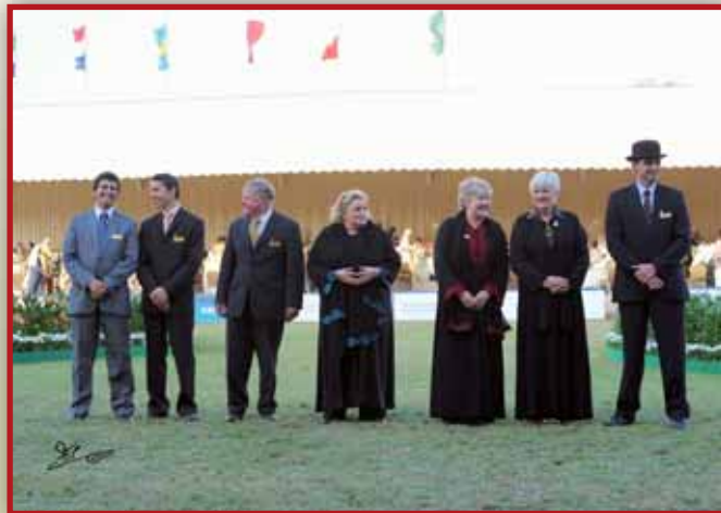
The Judges & Ring Master

ners was becoming extremely difficult and there were more and more 20s appearing on the screens made available by the organizer to display the scores. With 93.50 points Ajman Stud won with "PANAREA" (Wh Justice x Palawan), followed by "VENETZLA" (Versace x Giovanna) owned by Al Shaqab Stud in second position, with 93.40 points.